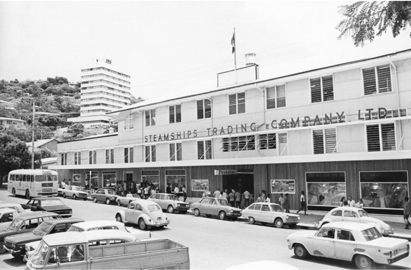
Above: Steamships Head Office in the 1970s Below: Its current location at Harbourside West facing Fairfax Harbour.