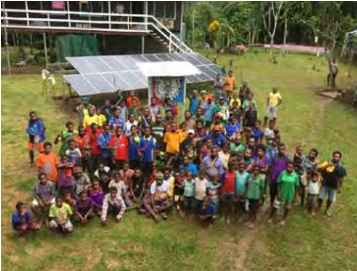
Wanang Community in Madang pose for a group photo. Steamships donated K124, 500 to assist complete a double classroom for Grades seven & eight and equipment for their new computer room.