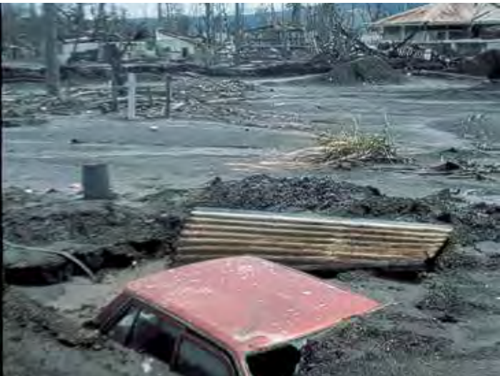
Eruption and aftermath, Rabaul, September 1994.