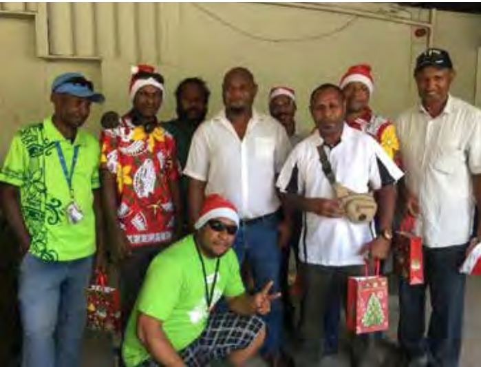
TPS staff and Management at their recent Christmas Party at the Head Office in Port Moresby.