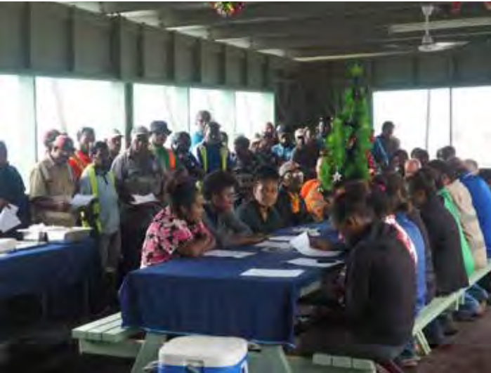
The team at Consort Lae prepare for their Christmas Lunch.