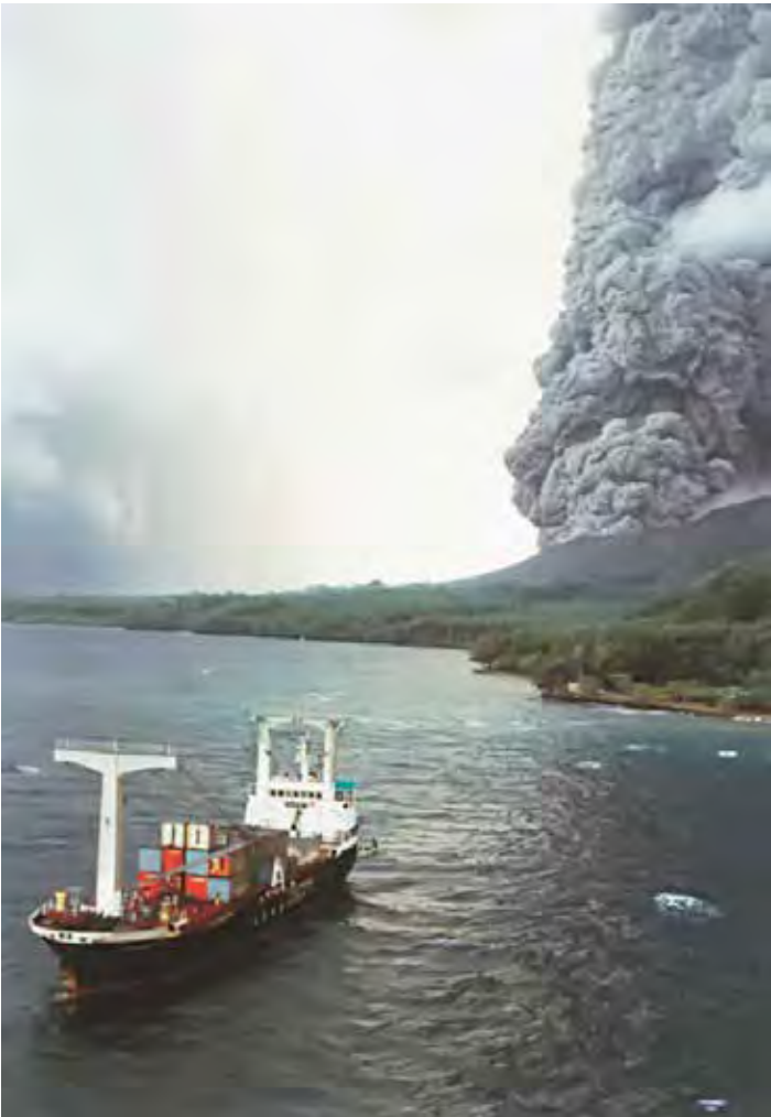
Volcanic eruption, Rabaul, September 1994.