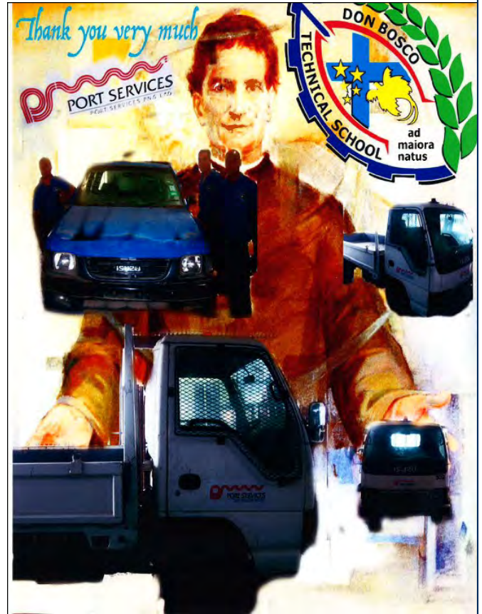
RIGHT: The thank you card that was sent to Port Services Ltd by Don Bosco Training School thanking the company for the vehicles. Seen are the two vehicles PSL gave.