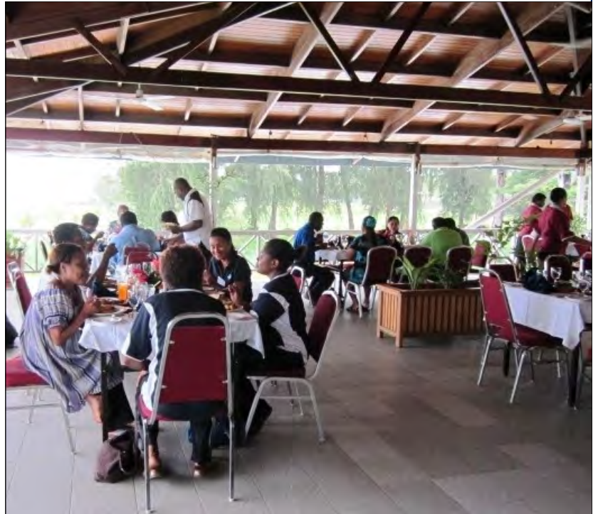
The luncheon that was hosted by Coastwatchers Hotel for its clients and business community in Madang

The lunch was a great success and Coastwatchers Hotel is looking at making it an annual event to keep the relationship between our corporate partners and CSH alive and well in the future.