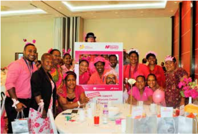
Celebrating Pink Ribbon in recognition of the continuous efforts of people living with Cancer.