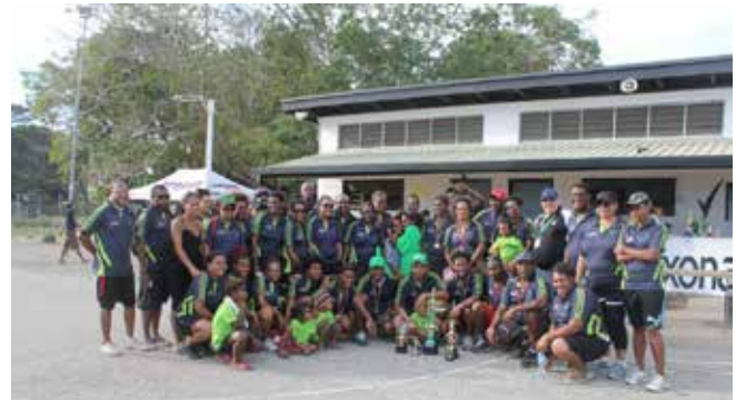
2014 Netball Finalist PPP.