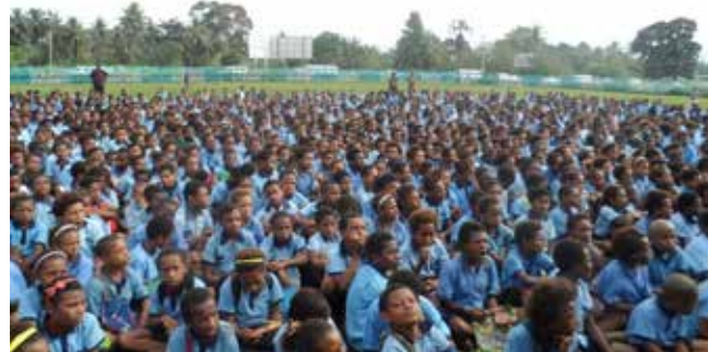
Students at the Omili Primary School assemble for the presentation of awards.