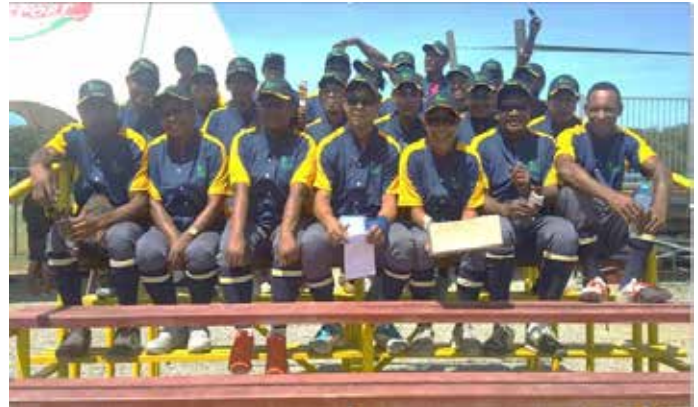
Pacific Palms Property taking time out for a team photograph during the Softball Tournament in October.