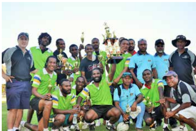
Top: 2011 MD Cup winner STC Lae 1. Bottom Right: 2010 Netball champions EWT Kundus.