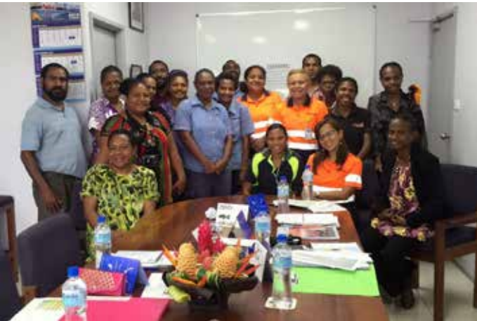
Members of Consort Toastmasters in Lae with KKKingston.