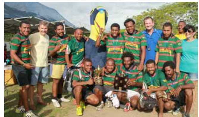
PSL Lahara 2014 MD's Cup winner.