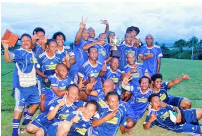
Winners of Steamships Rugby 7s and Touch in Lae– Highlander Eagle 1 and 2.