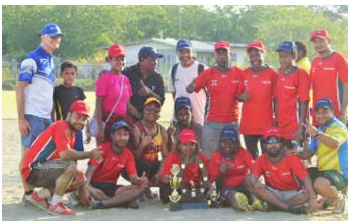
L-R:Winners of Steamships Softball Tournament in Pom– Swire Shipping.