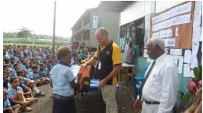
EWT Lae at the presentation at Omili Primary School.

The East West Transport Lae had the honor of representing the company at the Omili Primary School National Literacy Week school Awards on the 09th of September, 2016.