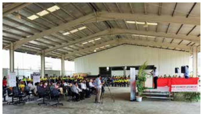
The Launching of Road Safety Awareness at EWT, Baruni.