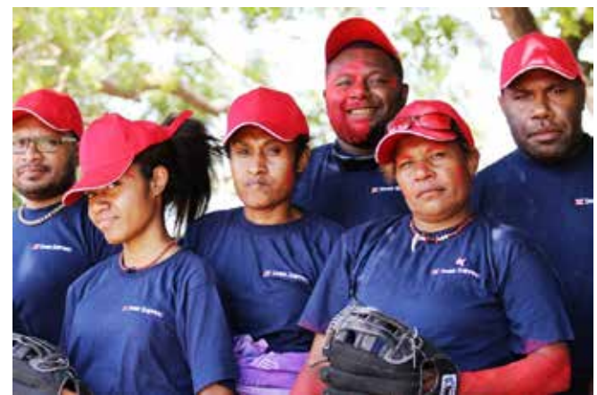
2013 MD's Cup winners for Softball– Swire Shipping.