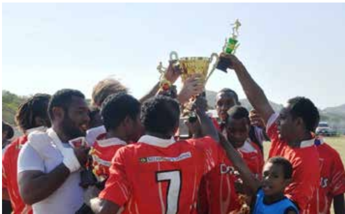
2010 winner Shipping One holding the MD's Cup