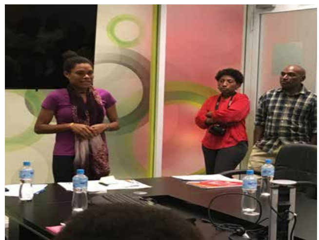
Staff from Child Fund presenting on Gender Based Violence.

These started with Gender Base Violence Awareness on Tuesday 26 th July , which was conducted by Child Fund PNG (picture above) who spoke about Gender Base Violence, understanding human & child rights and the service of helping Survivors of GBV ( Tok kaunselin Helpim Lain ). It was valuable for the 41 staff that attended.