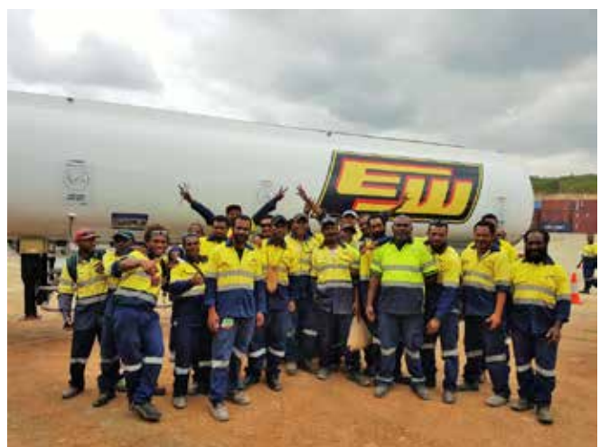
EWT Staff take a few minutes to pose during the staff BBQ.