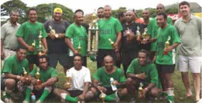
STC Lae 1 wins 2008 MD's Cup.

Rugby 7s is the oldest sport played by Steamships and is the only corporate company that continues to enjoy the sport. Recent years saw the introduction of additional sports including mixed netball and softball.