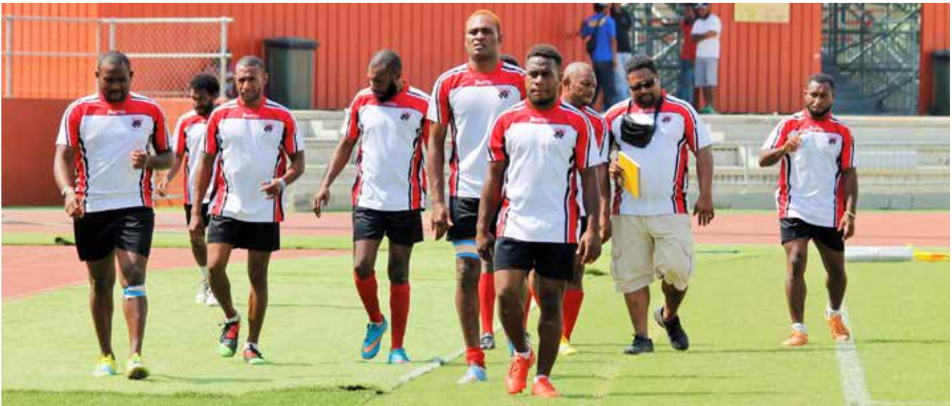
Winners of Steamships Rugby 7s Port Moresby– KPS Dockers