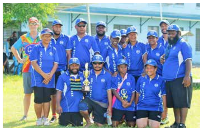
Winners of softball Tournament in Lae– Consort Liners