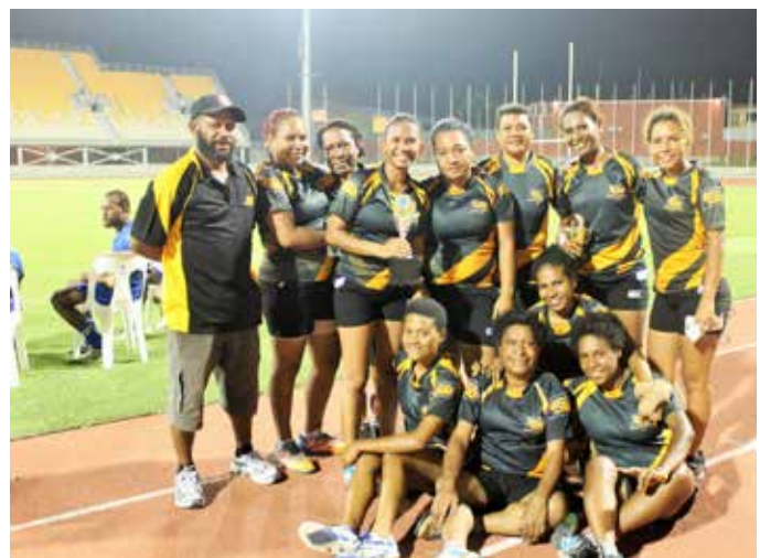
Winners of Steamships Touch in Pom– EWT Truckies.