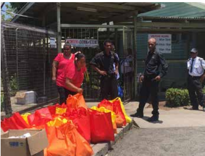
Grand Papua Hotel staff preparing to visit women at the maternity wing .