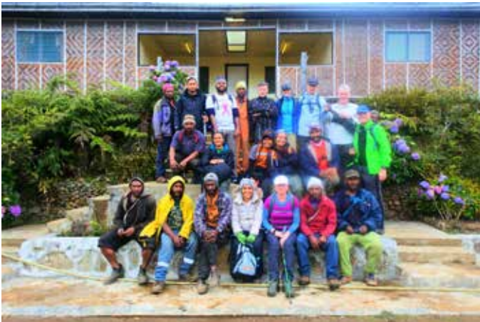
Climb Against Cancer Group One.

Climb Against Cancer Group One outside with their guides at JJ Camp at Gembogl in Chimbu Province. The team flew into Goroka on Friday 7th October and made a five hour drive to Gembogl the same day. The next day Group one hiked up to the Camp site just above 2000 meters above sea level. The hike up to the Lake side camps was approximately 4 hours.